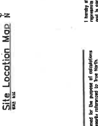
Exhibit A 1750 Commerce Drive